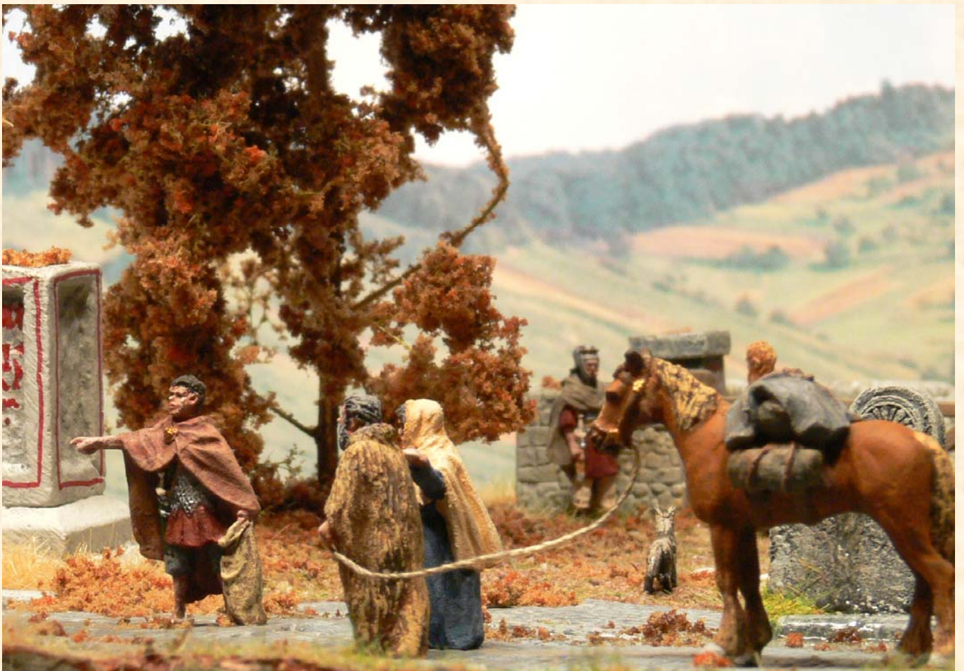
THE GUARD POST