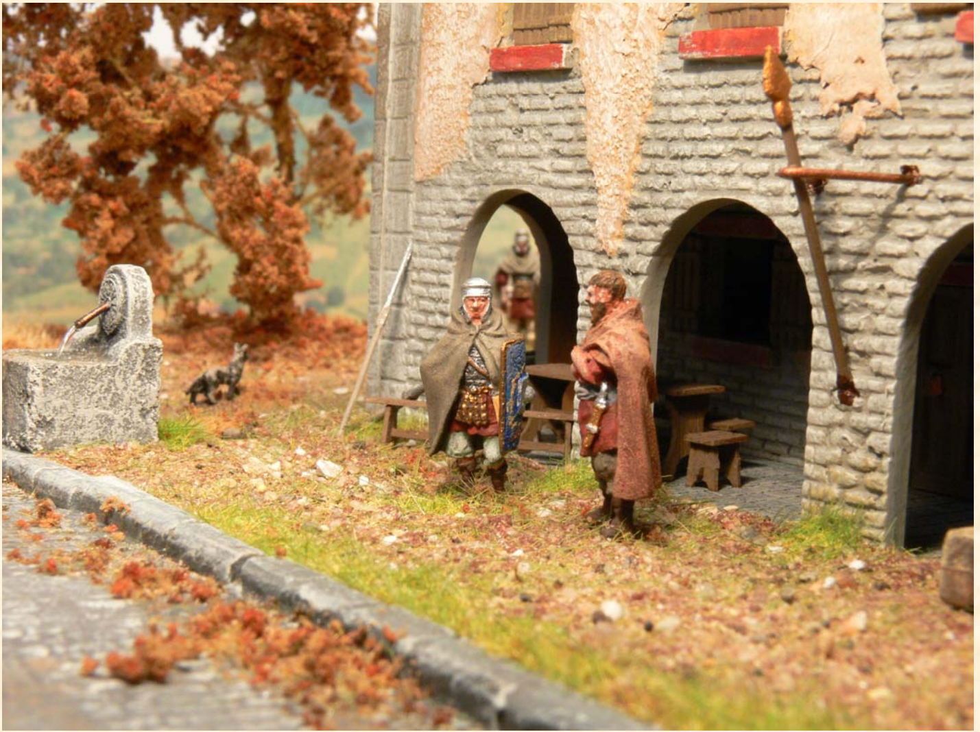
The statio itself is easily recognized as the Italeri Country House (6075), fountain and furniture by Fredericus Rex, and rest of the accessories and scenics is from various manufacturers (MiniArt, Nikolai, Noch, Torsten Burgdorf).